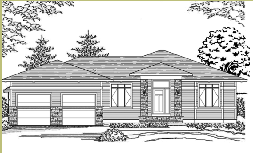
Custom Home #130 4509 Garrison Lane, Edina

Visit our website – CollegeCityDesignBuild.com for more College City Models, Design Workshops and more!