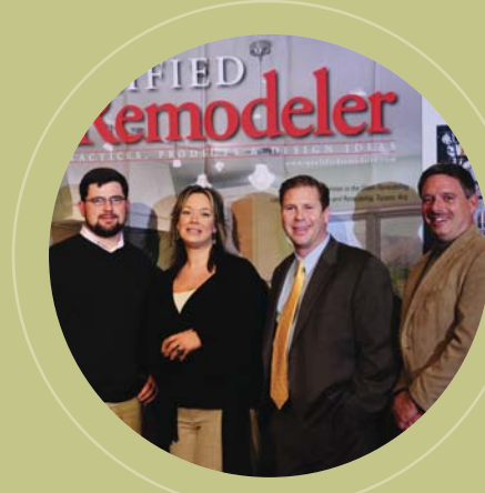
Qualified Remodeler awards ceremony.

We've been named a 2011 Master Design Awards winner by Qualified Remodeler magazine. The annual award recognizes outstanding achievement in residential remodeling projects in 22 categories. We won the Bronze award in the Whole House less than $200,000 category. Profiles of the projects will be published in the October 2011 issue and will appear on the magazine's website at QualifiedRemodeler.com .