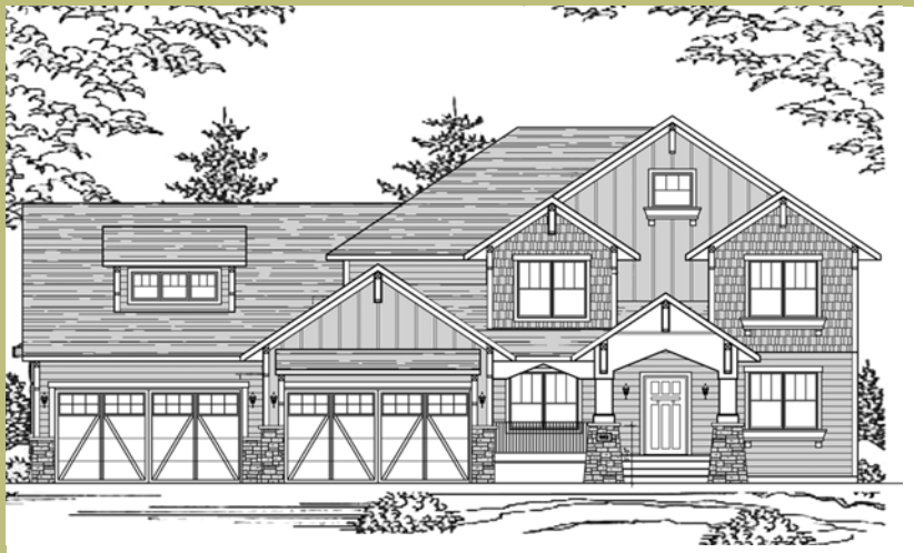
Custom Home #89 Liberty Park 1012 Freedom Court, Northfield

Prairie-inspired walkout rambler on a pond lot; large windows throughout the home; 2-chef kitchen, professional-grade appliances, custom steam shower, radiant floor heat in lower level and many more amenities.